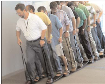
Team building is an important aspect of training teams.

Some church planting churches prefer to have their trainees onsite for an extended period of time so that the trainees can experience the culture of the mother church, while receiving practical experience. This approach is typically referred to as an internship or apprenticeship approach. Northwood Church in Keller, TX offers an example of this approach. Lance Ford has