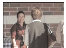
Leadership development at the Church of the Highlands begins with a belief that every believer is a church planter.