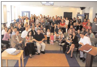
Crosspointe Church members pose for a family photo.