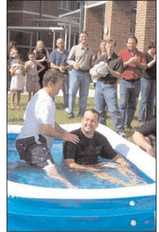
The church plant team at Church of the Highlands celebrates as a new member is baptized.