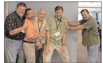
Leaders from Hill Country Bible Church.

Their church plants form the Hill Country Association, and they are very intentional about instilling this vision in every Hill Country plant. To accomplish this HCBC builds their training around what they call the "Seven Characteristics of a Model (or healthy) Church." They provide self-study materials for their planters to learn the nuts and bolts of church planting (such as the Church Planter's Toolkit by Bob Logan. 3 ) But their passion is instilling these characteristics in the genetics of the new church. And to ensure this, they have created diagnostic questions for accountability. (See sidebar.)